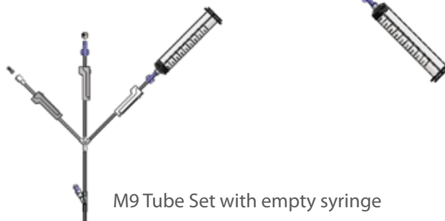
M9 Tube Set with empty syringe