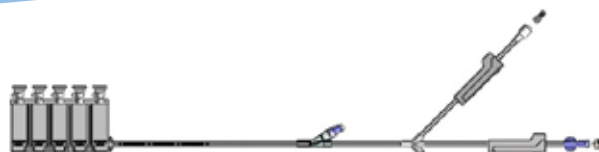
CS30M9 with empty syringe